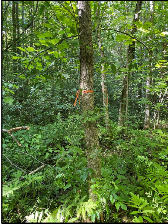
Photograph 1. Black Ash Tree #2, Trunk (Sept. 19, 2024)