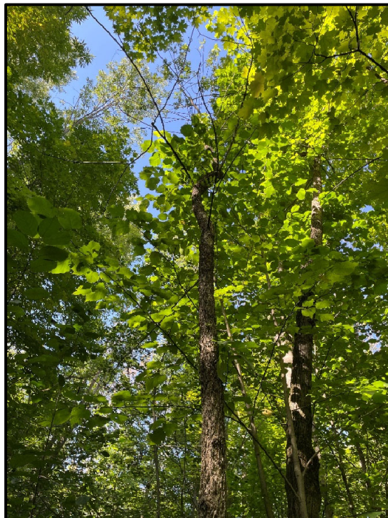
Photograph 4. Black Ash Tree #3, Crown (Sept. 19, 2024)