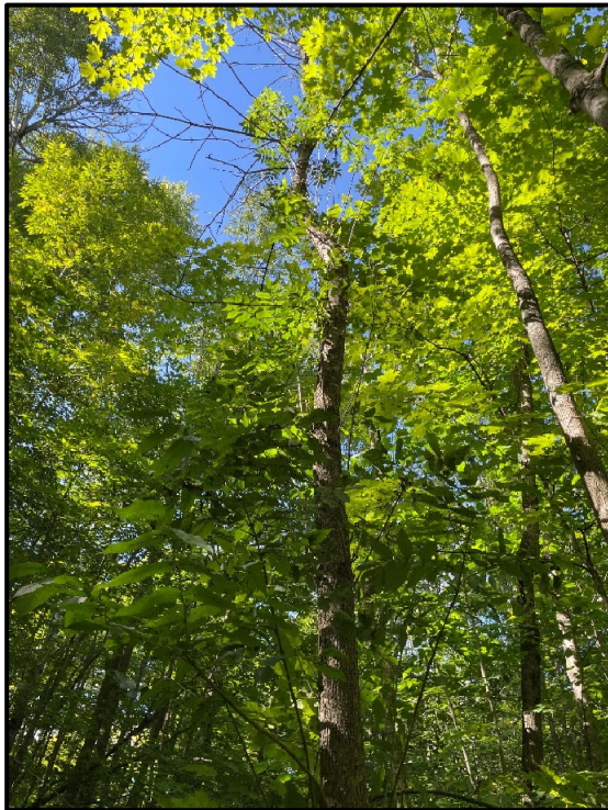
Photograph 2. Black Ash Tree #2, Crown (Sept. 19, 2024)