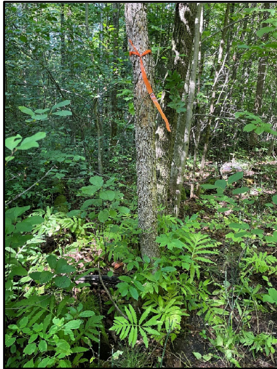
Photograph 3. Black Ash Tree #3, Trunk (Sept. 19, 2024)