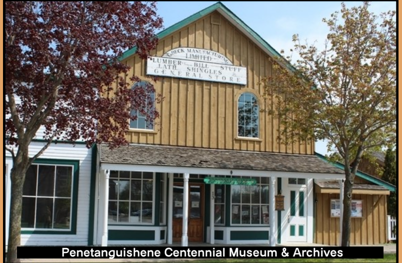
Penetanguishene Centennial Museum & Archives